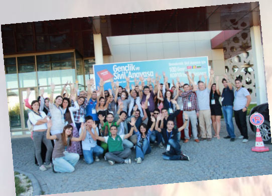
Europe Day 2012, Ankara

Overall objectives of the project were: 1.To increase the consciousness of young people as active citizens by the development of representative democracy. 2.To raise the awareness of young people about the political and social problems. 3.To encourage young people for active participation and involve them to express themselves effectively, during the preparation of a new constitution rather than being passive about the issue. 4.To inform the Turkish youth about the EU establishment principles and the preparation process of EU Constitution. Specific Objective was to make contribution to the parts of the new constitution related to youth , which will be the first democratic and civil constitution of Turkey , by sharing experiences and suggestions with the help of 70 students from the universities from all over the country and young people from the universities located in Konya and 30 students from EU countries, such as our neighbor countries Greece, Romania and Bulgaria. 26th August - 1st September 2012, Konya