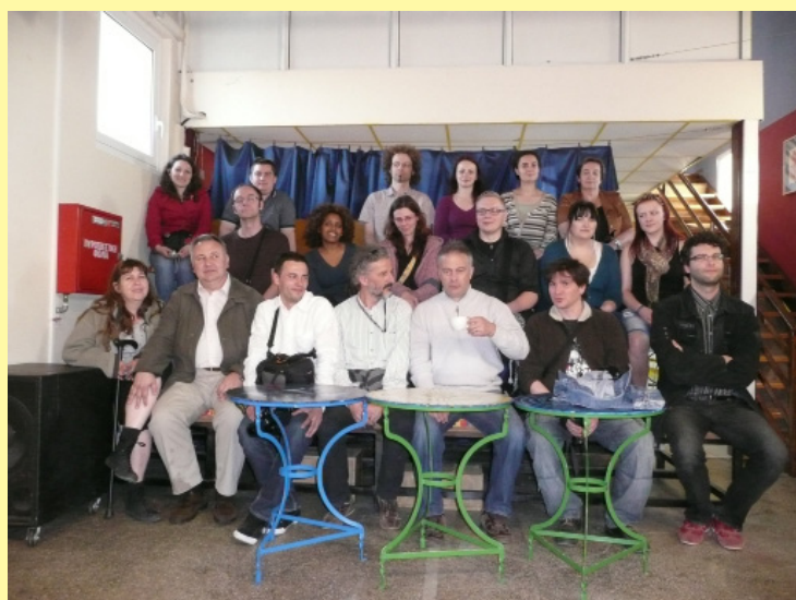
Youth Workers & Pool of trainers' meeting's REPORT. Corinth, Greece.