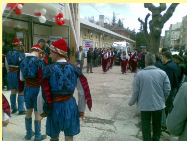
Youth Caravan in Eskisehir