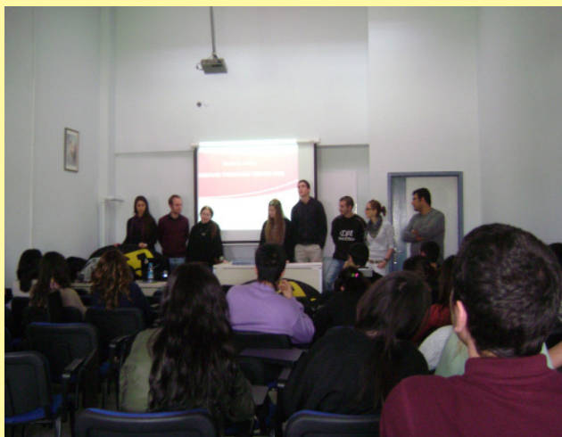
EVS presentation in Ankara University, Gölbaşı