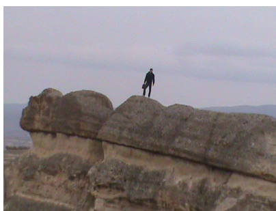
Great view in Cavusin