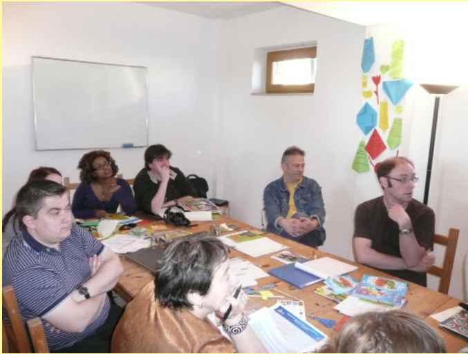
● Youth Workers & Pool of trainers' meeting's REPORT. Corinth, Greece.