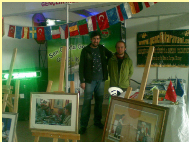
Youth Caravan in Eskisehir