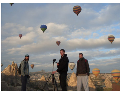
In Göreme, 6 am

You can see the videos here: http://dl.free.fr/naiXWZEA1 http://dl.free.fr/dzdM2d3Ze