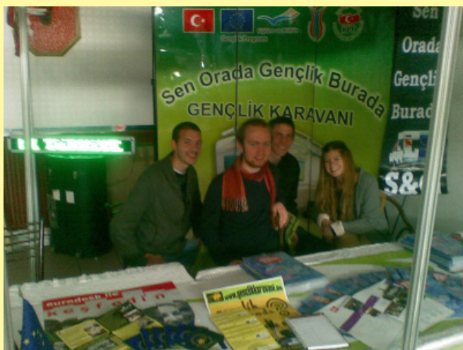
Youth Caravan in Eskisehir