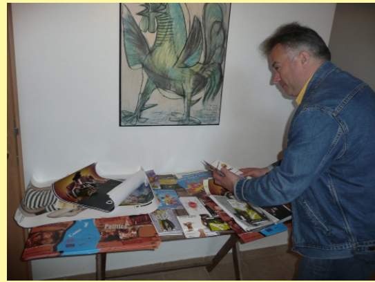
● Youth Workers & Pool of trainers' meeting's REPORT. Corinth, Greece.