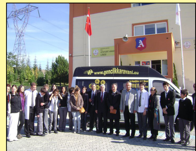
● Meeting in a high-school in Eskisehir.

● You can see more here: http://www.systemandgeneration.eu/