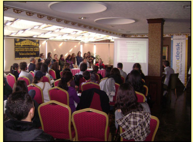
● EVS meeting in Ankara.