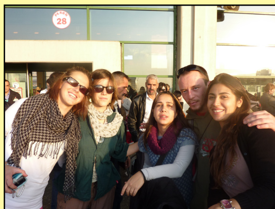
● Here, in our fantastic trip to Georgia and Armenia in November.