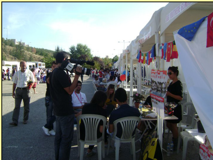
● Giving information in the University, Ankara.