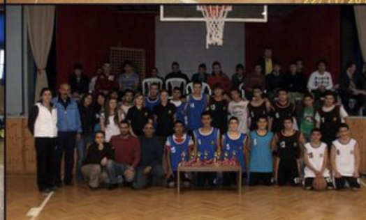
● 'Block against violence'. Youth exchange in Ankara.