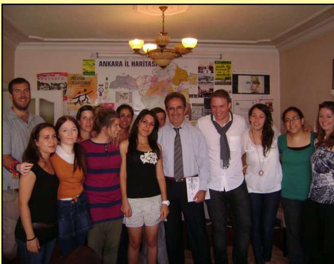
● Anna Lindh Foundation President in S&G office.