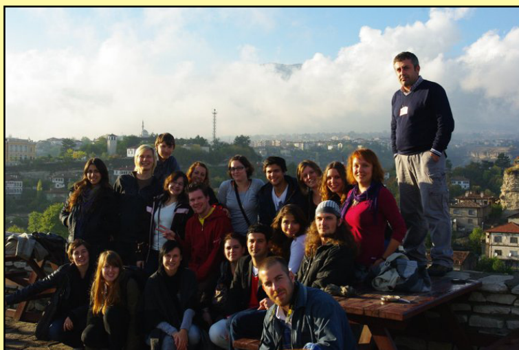
● EVS Middle Term week in Safranbolu.