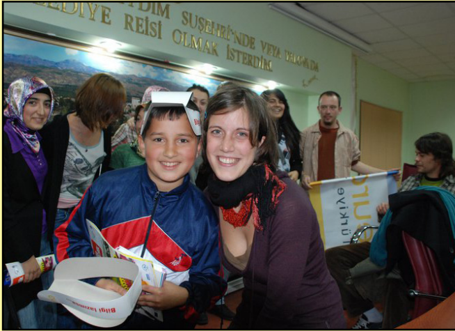
● EVS Meeting in Susehir, near Sivas.