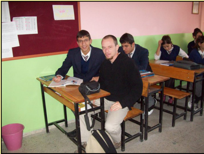
● Sharing experiences with young people in a high-school in Tosya.