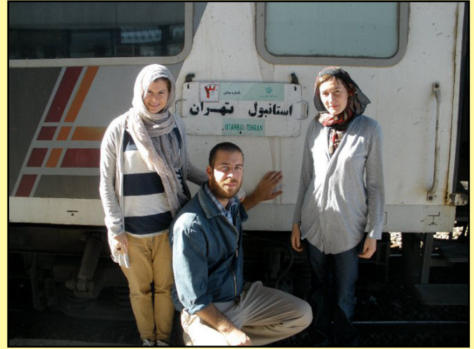
● The begining of our amazing trip to Iran!